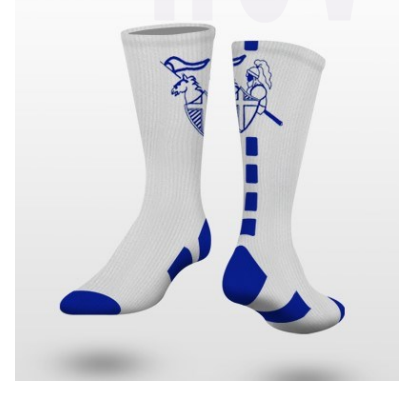
#1 White w/ logo on Back, Blue Accent