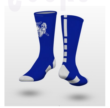
#2 Blue w/ logo on Front, White accent