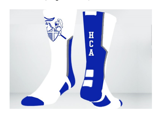
#4 2.0 Style, Logo on Front

Shoe Size: (Men) youth 2-5, small 6-8, med 8-10, large 10-13, XL 14+ (Women) youth 4-7, small 7-10, Med 10-13, large 13+