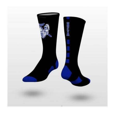
#3 Black w/ Logo on Front, Blue Accent